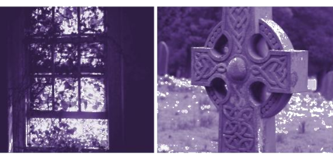
After Sunday Services